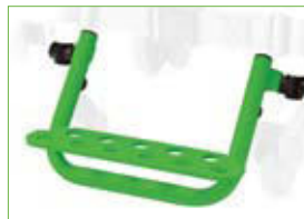
Foot Support 6254-029-000