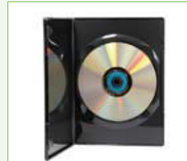
In-service Video 6253-001-167