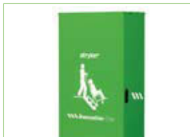
Storage Cabinet 6254-002-000