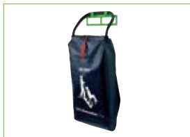
Chair Cover 6254-055-000