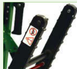
Aggressive Stair-TREAD Belt † Available as an option

*The Aggressive Stair-TREAD Belt is designed to improve the grip of the Stair-TREAD system on steps that have a smooth surface with a rounded edge. To determine if the Aggressive Stair-TREAD Belt is appropriate for your application, please refer to the Aggressive Stair-TREAD Belt Specification Sheet at www.strykerevacuation.com or contact your local Evacuation Consultant.